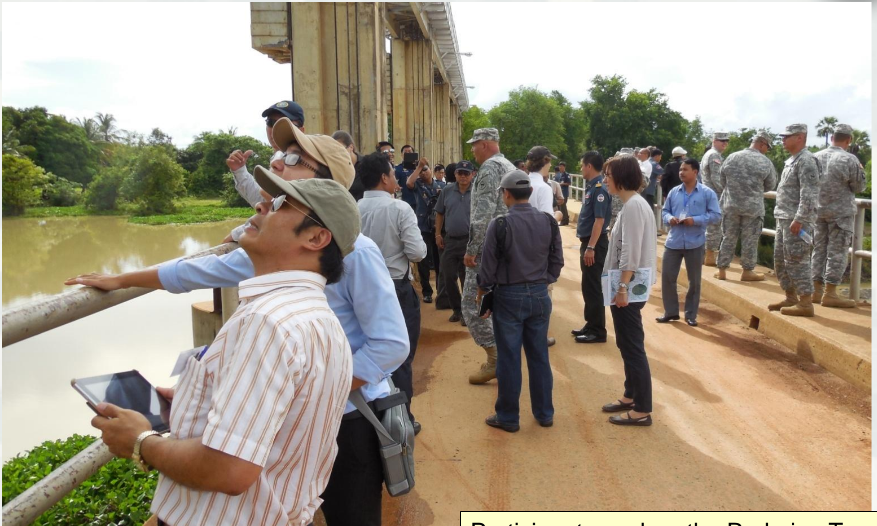
Participants explore the Ro Laing Tray Dam in Kampong Speu Province