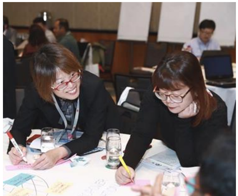
Members of NexGen Young Scientists work to develop the exchange program.

NexView’s NexGen fellowship and academic exchange program selected its first cohort. These young scientists began the program in winter 2021. They are currently studying natural resource management capacity-building and tools to explore the socio-economic trade-offs among policy decisions for water, energy, food, and environment.