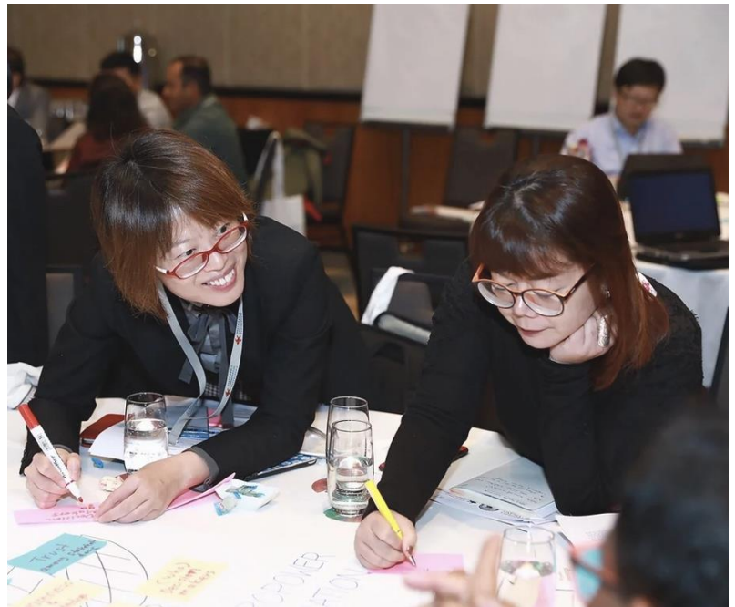
Members of NexGen Young Scientists work to develop the exchange program.

NexView’s NexGen fellowship and academic exchange program selected its first cohort. These young scientists began the program in winter 2021. They are currently studying natural resource management capacity-building and tools to explore the socio-economic trade-offs among policy decisions for water, energy, food, and environment.